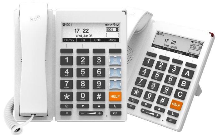
FIP12WP Home (*Image Customization)